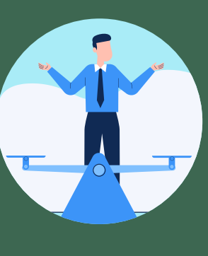
Work-life improved balance